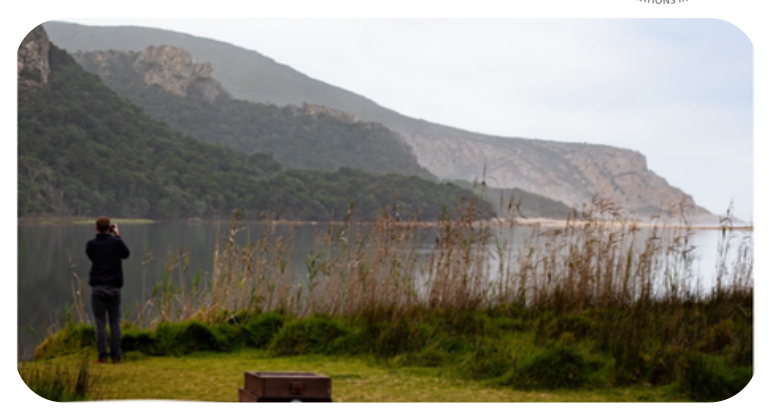
Image: Nature's Valley Estuary.

The 2025 cohort of TILL trainees consists of a diverse group of Undergraduate students, Graduate students, and Postdoctoral Fellows from Germany, South Africa, and Canada. While onsite, trainees will work in international teams under the mentorship of applied researchers, practitioners, and community partners. They will develop a systematic understanding of Coastal and Marine Protected Areas in the region by engaging in projects designed to address local issues aligned with the Sustainable Development Goals and the Garden Route Biosphere Reserve's research and development needs.