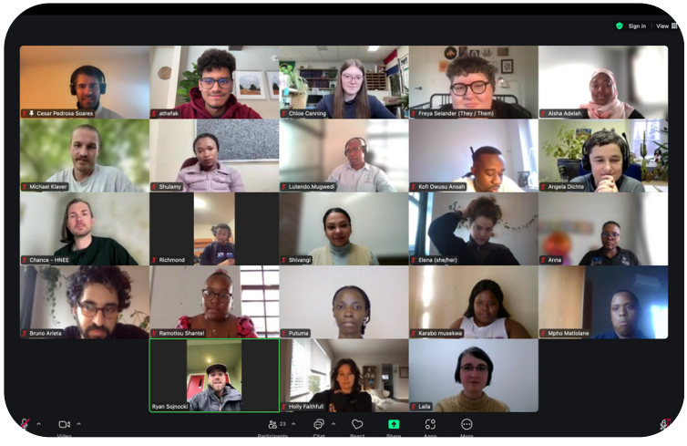
Image: START organized meet-and-greet event with TILL alumni, TILL mentors2025, and TILLies2025 attended.

START has also been focusing on finding more mentorship opportunities for students who want to work with Biosphere Reserves/Regions (BRs). We have presented ideas for possible mentorship opportunities and are considering many options for what this could look like. If you are a BR interested in getting more students involved, please contact <a href="mailto:start@usask.ca">start@usask.ca</a>!