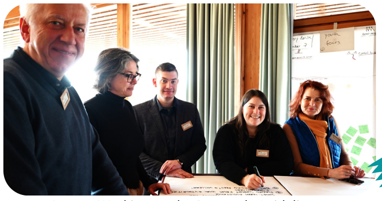
Image: Working on the Research Guidelines.