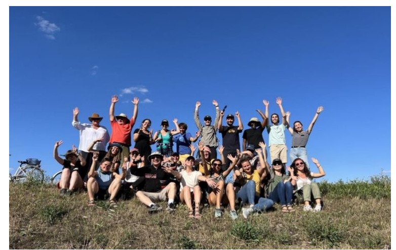
Image: Students and mentors at the mini-TILL in the Elbe River Landscape Biosphere Reserve.