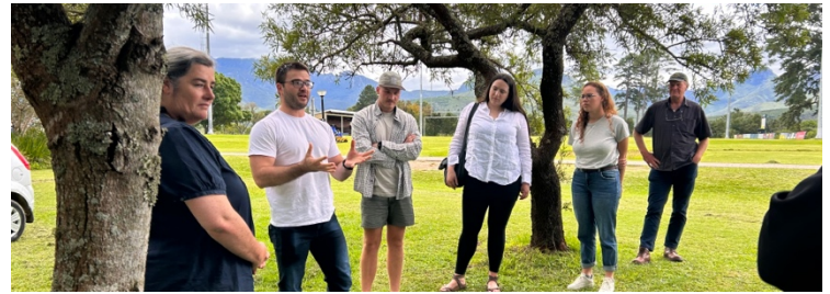
Image: Nelson Mandela University student presents his research on human-wildlife conflict on campus to the TRANSECTS team.