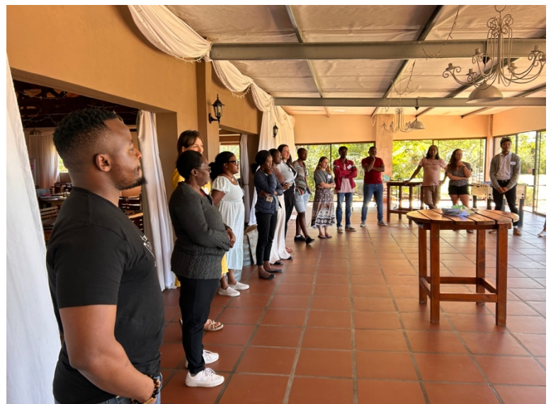
Image: Those attending the Indaba in South Africa share their “tiny books” in a reflexive transdisciplinary activity.

The TRANSECTS team has decided to pursue a Spencer Foundation Research-Practice Partnership Grant in 2023. Many excellent application ideas resulted from a program-wide meeting held on May 9 th .