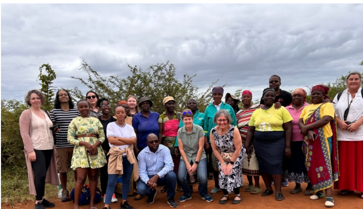
Image: Members of the Saselemani Adopt a River project visit with TRANSECTS members in the Vhembe Biosphere Reserve.