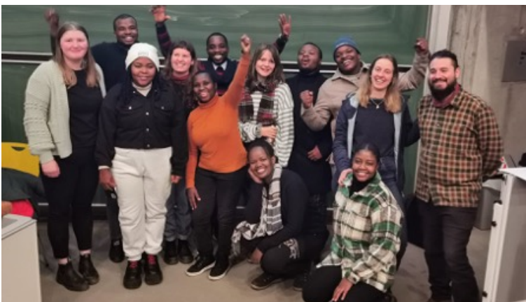
Image: Students on presentation day at the TILL hosted by HNEE and Schorfheide-Chorin Biosphere Reserve.

The first micro-credential offered by TRANSECTS , Foundations in Collaborative Research, was successfully completed by students in early 2023. This micro-credential was developed in partnership with The Resilience Institute and the University of