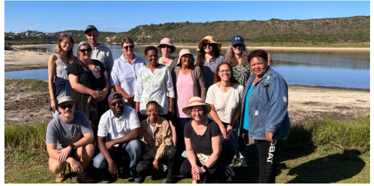
Image: The Fisherladies meet with Garden Route Biosphere Reserve practitioners, mini-TILL students, and TRANSECTS members.