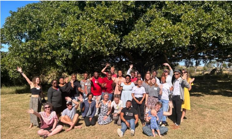
Image: TILL students, local practitioners, and TRANSECTS members gather at the South African TRANSECTS team's Indaba.

TRANSECTS partners in each of these Biosphere Reserves are excited to host South African TILLs in 2025 and 2027, which will provide a cohort of international students the opportunity to engage in transdisciplinary research in collaboration with local practitioners and community partners.