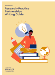
Image: Spencer Foundation Research-Practice Partnerships Grant writing guide.

After each case study, participants will engage in structured reflection activities or learning circles to generate evidence of learning and social change. Notification of the application's success is expected by mid-2024.