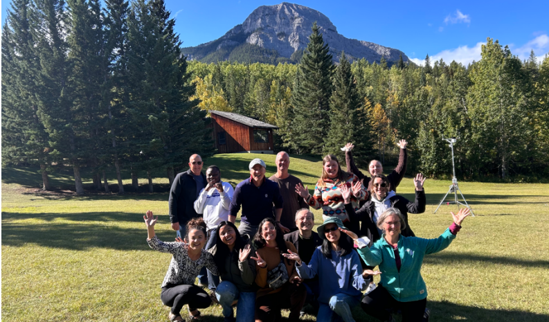
Image: TRANSECTS members and SENS students at the Program Institute in Canada.