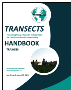
Image: TRANSECTS Handbook cover page.

In August 2023, TRANSECTS program handbooks were released for key audiences within the community of practice, including trainees, educators, and practitioners. These handbooks serve as central documents for program information, policies and procedures, and roles and expectations. All TRANSECTS members, partners, and interested audiences are welcome to email transects@usask.ca to view the handbooks.