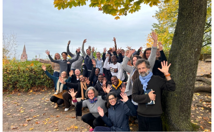
Image: Program Institute attendees in Germany, including practitioners, shared responsibility holders, and representatives from academic institutions from Canada, South Africa, and Germany.