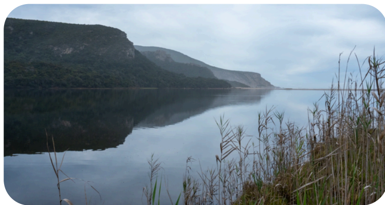
Image: This image showcases the estuary at Nature's Valley, the main location for TILL 2025.