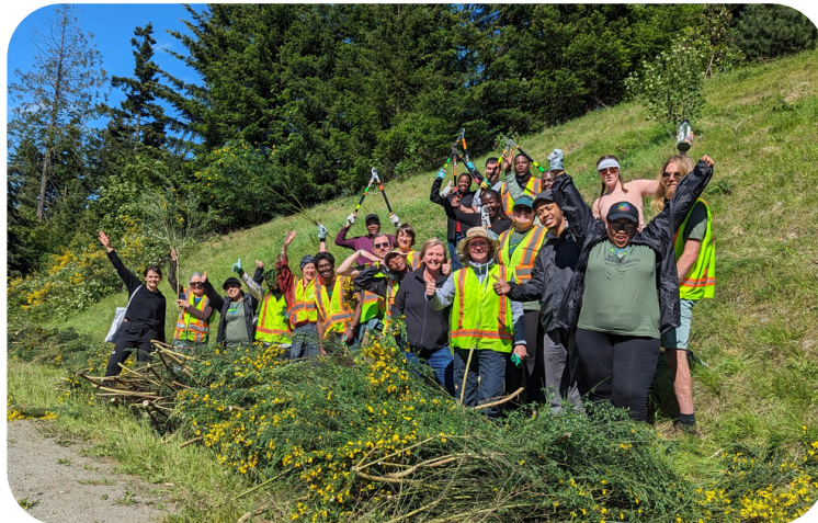
Image: TILL 2024 trainees removing Scotch Broom with the Broombusters at Vancouver Island University.