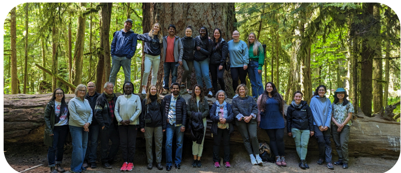
Image: 2024 Program Institute participants visiting Cathedral Grove in the Mount Arrowsmith Biosphere Region.

The Program Institute centered around the theme "MIND THE GAP: ALIGNING ACTIONS WITH ASPIRATIONS." As we near the midpoint of TRANSECTS , the 2024 Program Institute offered a valuable opportunity to evaluate our progress toward the original goals and intentions of the initiative and to explore ways to better align our actions with these objectives. The presentations and activities reflected this focus. We extend our heartfelt thanks to everyone who participated and contributed to the success of the Program Institute. Read more about the 2024 International Program Institute in Canada here .