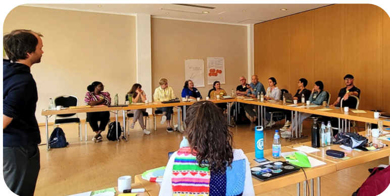
Image: Participants at the EuroMAB 2024 Workshop.